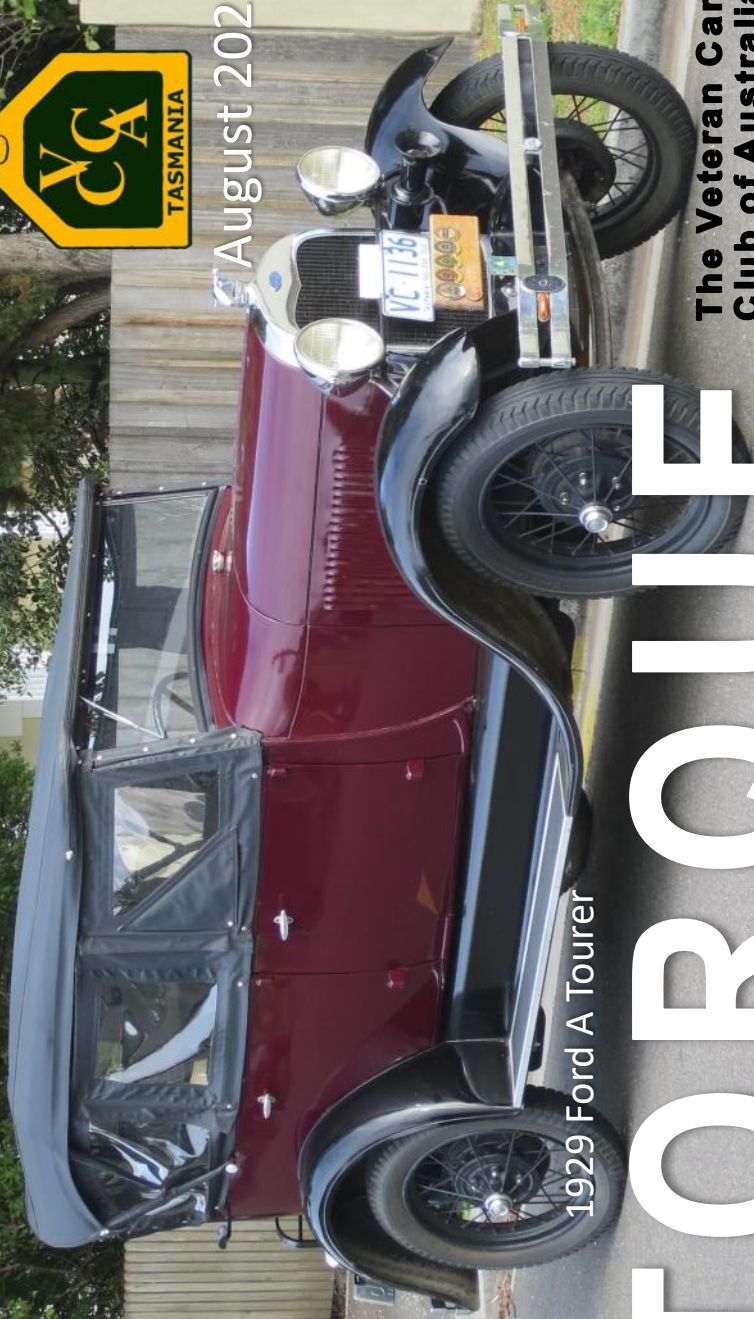
1929 Ford A Tourer